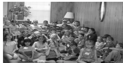
Character Camp 2005

Call early for the best rates or if you need more brochures for your church, friends, or family. You may register by calling me (Angela) at 225-715-1587.